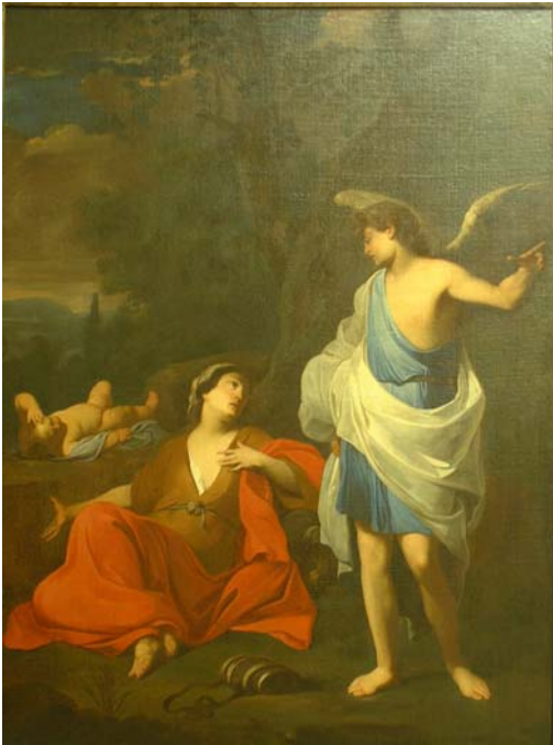
Follower of Simon Vouet (French, 1590-1649), Hagar and Ishmael , oil on canvas, Anonymous Donor, Collection of Florida State University Museum of Fine Arts.

After you walk in the front door, walk straight through the first section, past the desk and into the next gallery space. Just after the desk take an immediate right and you will see this painting: