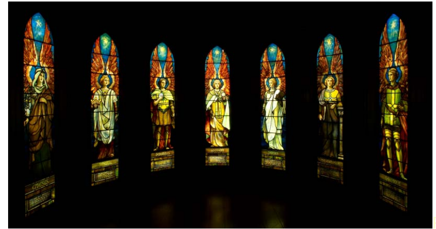
a Louis Comfort Tiffany, Angels Representing Seven Churches (1902-1903), glass.

This series of stained glass windows represent seven different images of angels from the Book of Revelation.