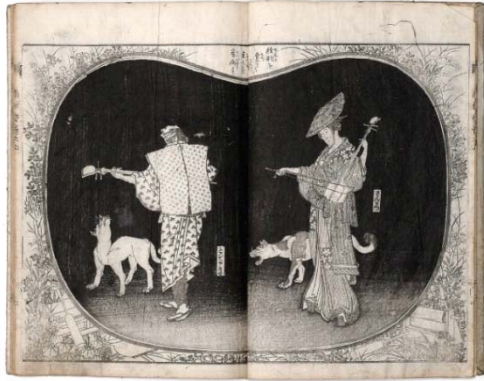
A Dream of Nanka, Hokusai

9. The term, ukiyo-e, refers to a genre of Japanese woodblock prints and paintings produced between the 17th and 20th centuries. In this period, although the traditional classes of Japanese society were bound by numerous strictures and prohibitions, the rising merchant class was relatively unregulated, and turned its attention to temporal pursuits rather than “timeless issues.” Ukiyo-e, translated into “pictures of the floating world,” generally features scenes of everyday life and leisure time. Find two works that you feel represent the “floating world” among Hokusai’s works and explain why.