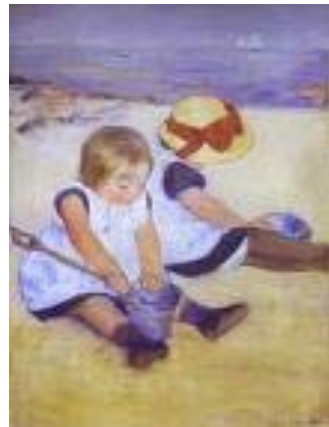
Children Playing on the Beach, Mary Cassatt

10. Hokusai is famous as a precursor to Impressionism, a style of painting in France at the end of the 19th century. In Japan, toward the end of the Edo Period (1854), the government opened its ports which allowed the introduction of Japanese culture to the West. As a result the bold designs of Japanese woodblock prints influenced the Impressionists. The Japanese asymmetrical arrangements as well as the contrasting large areas of flat color with patches of intricate pattern offered a compositional format through which the Impressionists could develop their ideas about color. Besides color and composition, how does Hokusai’s print influence Impressionism? Consider Mary Cassatt’s image Children Playing on the Beach and Hokusai’s image, The Great Wave of Kanagawa .