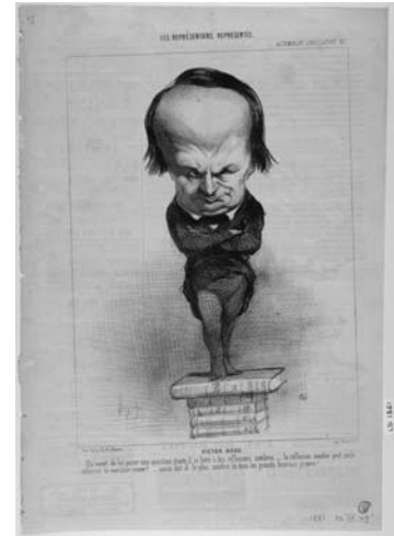
Print #123, Daumier