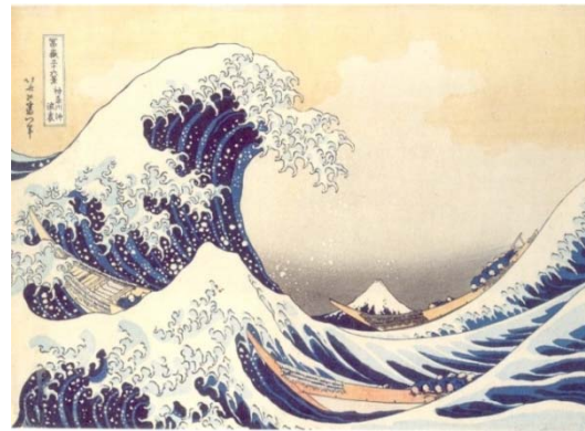
The Great Wave of Kanagawa, Hokusai

11. All styles seemed open to Hokusai—Japanese, Chinese, and Western. Even though Japan was isolated from the West during his life (1760-1849), Hokusai could study western style through Dutch books that had been filtering into the country. Foreign prints gave him a basic knowledge of western realism and perspective rules. Name a print that seems to show the influence of the western style on Hokusai’s imagery? Hokusai was influenced by Dutch and French landscape paintings. Hokusai saw etchings of landscapes by artists like the Dutch painter Koninck Philips (1619-1688). Look at some of Philips’s paintings on the internet and compare them to Hokusai’s prints.